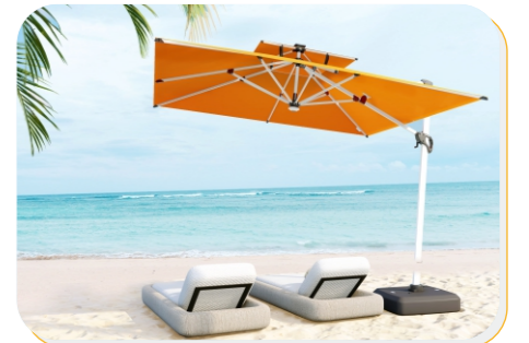
Cantilever Umbrella | Square