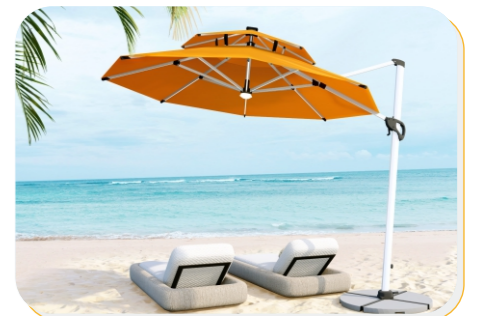
Cantilever Umbrella | Round